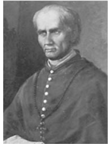
Joseph Sadoc Alemany, OP

California, having recently passed from Mexican to American rule and still containing a large Spanish population with Spanish customs and traditions, the appointment of Archbishop Alemany as the first bishop under the changed conditions was a providential measure. Ten years of missionary activity in Ohio, Kentucky, and Tennessee had enabled him to master the English language, which he spoke and wrote correctly and fluently. This familiarized Bishop Alemany with the customs and spirit of the Republic and imbued him with a love for the United States, which he carried with him to the grave.